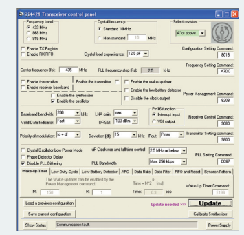
WIRELESS DEVELOPMENT SUITE

The Wireless Development Suite (WDS) provides developers a comprehensive toolset to quickly and easily create and deploy efficient, robust and low-cost wireless applications. WDS can be used for demonstrating part capabilities, testing performance, and prototyping application examples, with little or no RF design and measurement experience.